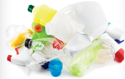
Plastic Bottles, Tubs & Jugs LIDS ATTACHED