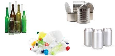
Glass | Aluminum | Tin | Plastic

Cardboard can only be recycled at a drop-site and has its own bin