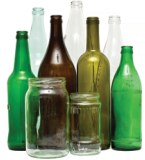
Glass Jars & Bottles WITHOUT LIDS