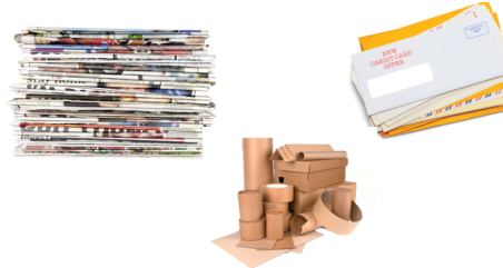
Newspaper | Magazines | Office Paper Paperboard