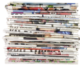
Paper NEWSPAPER, OFFICE, PACKING & MIXED USE