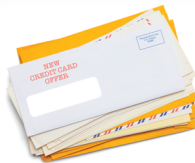
Junk Mail & Magazines

In Eagle County 81% of your waste can be diverted from the landfill by recycling and composting!