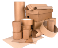
Paperboard NO FROZEN FOOD BOXES