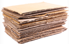
Cardboard DECONSTRUCT & FLATTEN BOXES