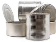
Tin Cans REMOVE LABELS IF POSSIBLE