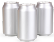
Aluminum Cans REMOVE STICKERS & WRAPPINGS, DO NOT CRUSH